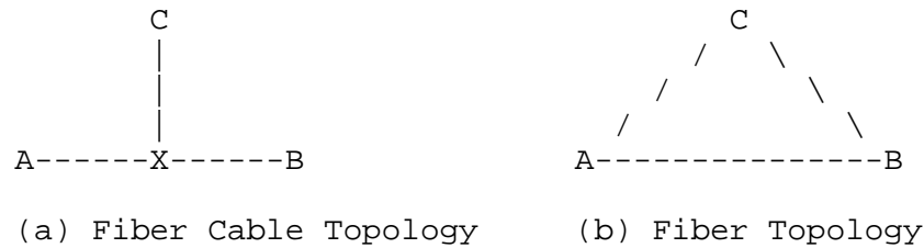
Figure 6-2. Fiber Cable vs Fiber Topologies

The imminent deployment of ultra-long (>1000 km) Optical Transport Systems introduces a further complexity: Two OTSes could interact a number of times. To make up a hypothetical example: A New York - Atlanta OTS and a Philadelphia - Orlando OTS might ride on the same right of way for x miles in Maryland and then again for y miles in Georgia. They might also cross at Raleigh or some other intermediate node without sharing right of way.